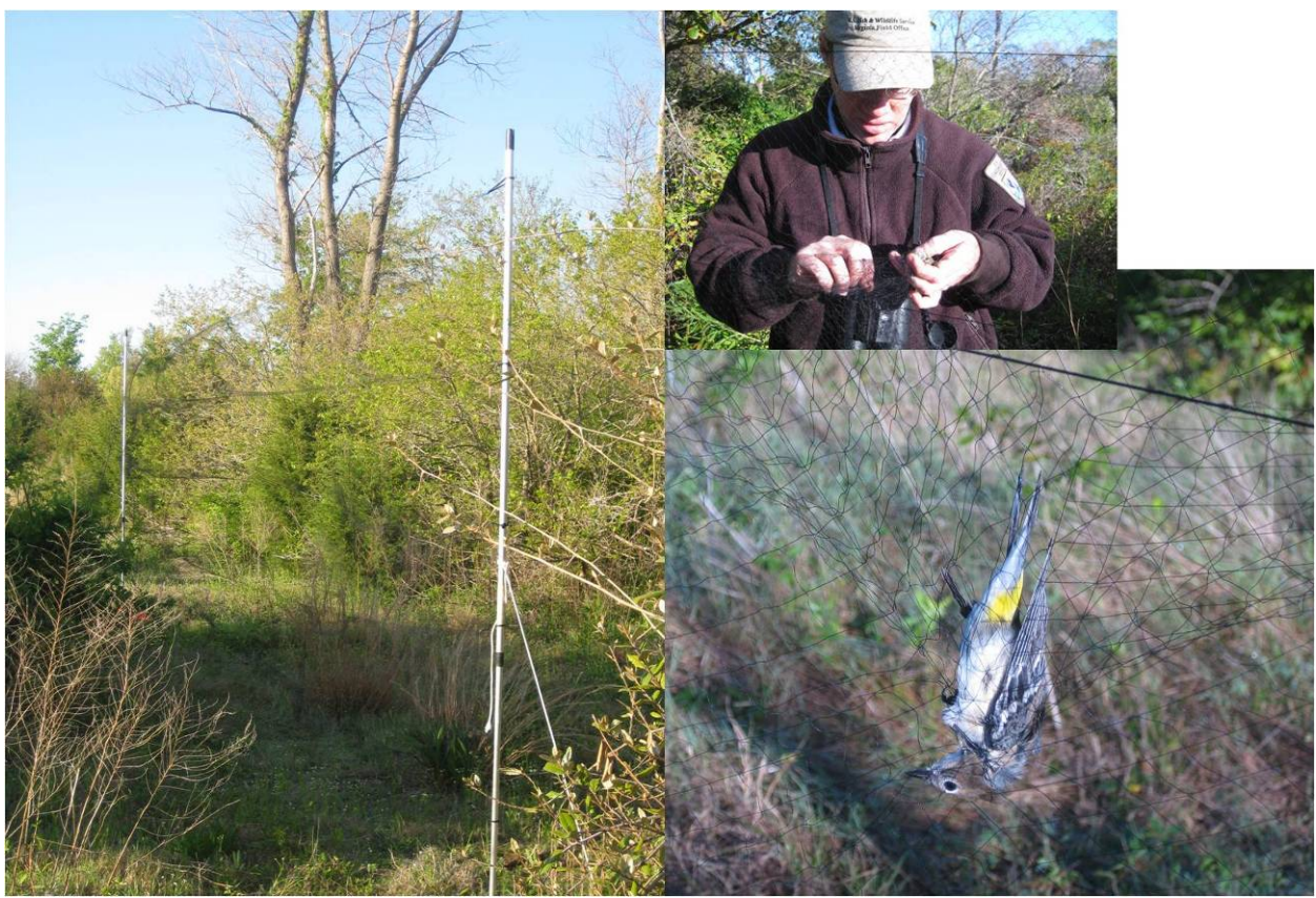
Figure 5. Mist net (left), removing bird from mist net (upper right), yellow-rumped warbler in net (lower right).