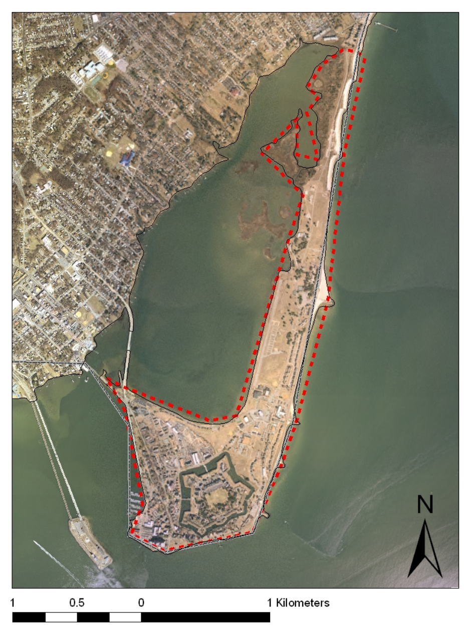
Figure 1. Fort Monroe, outlined in a red dashed line.