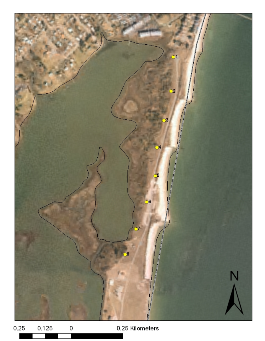
Figure 3. Survey points at Dog Beach area.