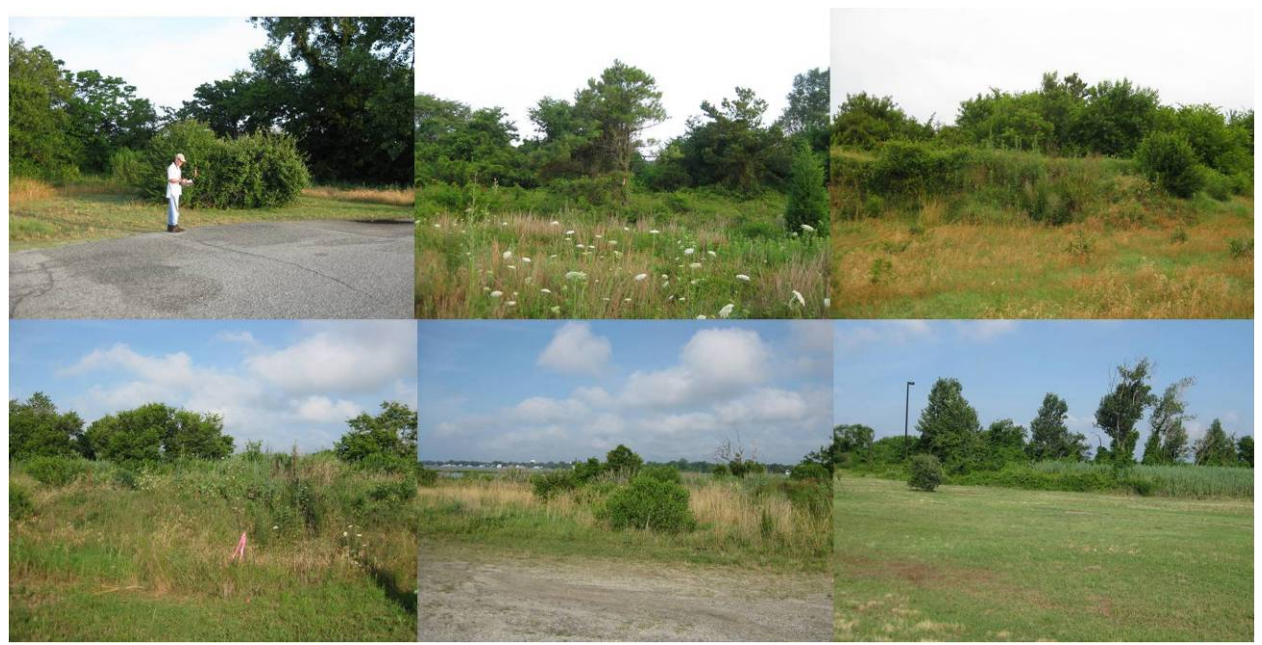
Figure 4. Photos of six (6) survey points (no photos of the remaining two)