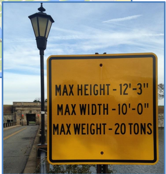
Height and Width Restrictions for the Main Gate sally port. Please contact the museum if alternate accommodations are needed.